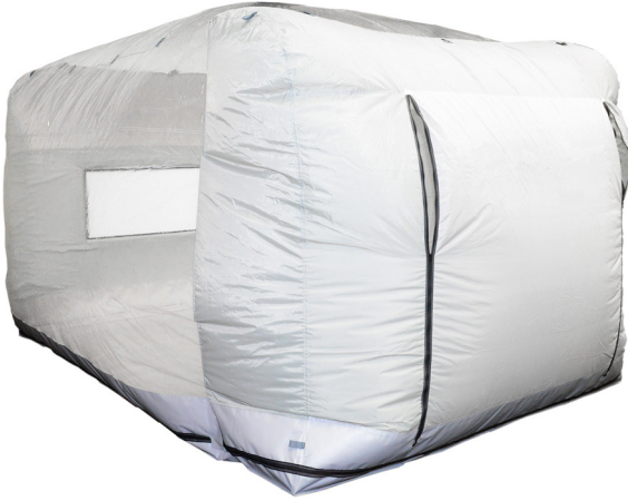
Integrity Portable Cleanroom Tent*