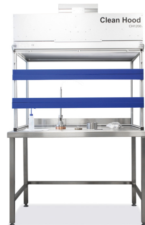
Integrity Clean Hood